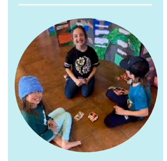
Wednesday, April 24th: Fort Ross Day Trip: 8:15-5:30 PM