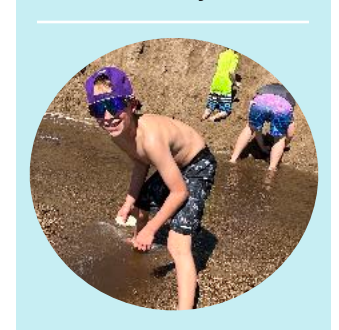
Tuesday, April 23rd: Fort Ross Project Due